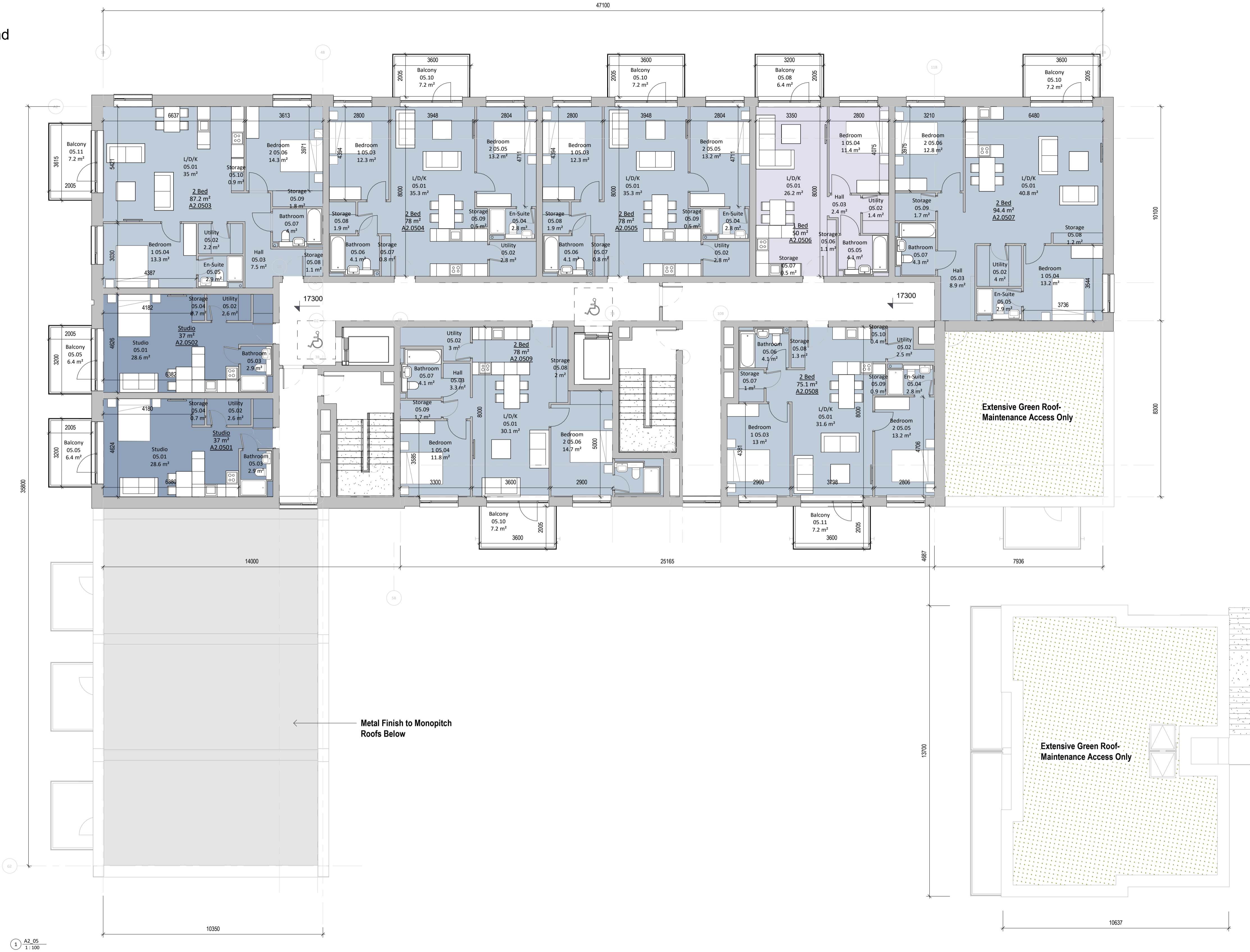
Block A2_Level 05